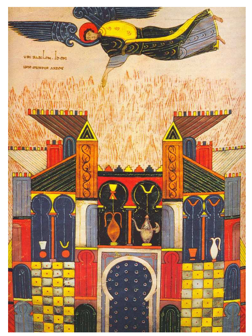
Beatus of Facundus: Judgement of Babylon.