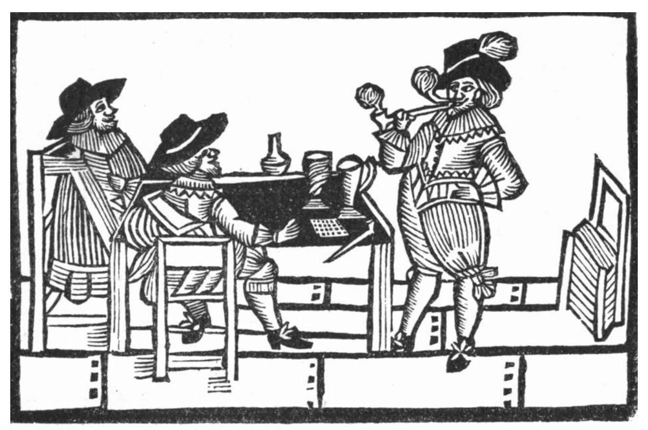
FIG. 12. A Tavern Scene. (From a ballad in the Pepysian Collection.)

The Minstrels, roaming up and down the land singing bawdy ballads and furnishing music in taverns, at fairs, and at country wakes and feasts, were in very bad repute. But at the same time they were very popular. (page 43)