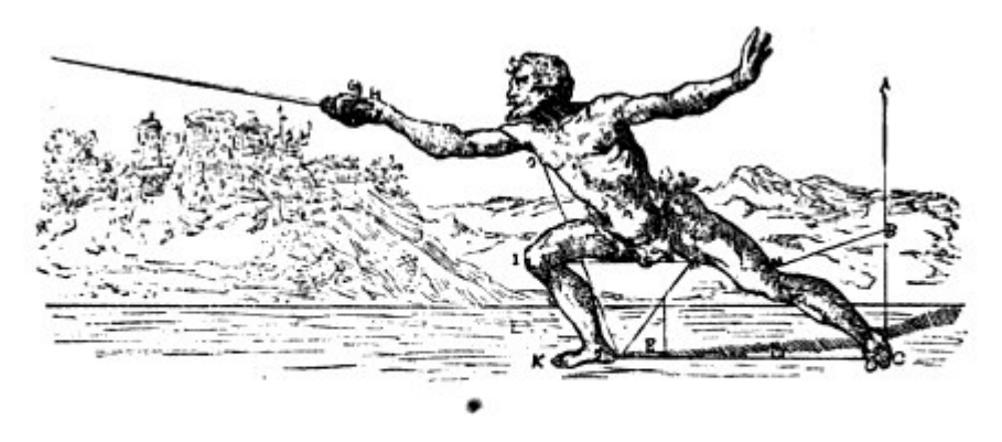
Fig. 65.—Capo Ferro, 1610.—"A figure showing the guard, as practised in our art, and the incredible increase of reach due to the 'botta lunga,"—all the limbs moving together in the attack."

[With this book, you can study Capo Ferro and Agrippa, like Inigo Montoya....]