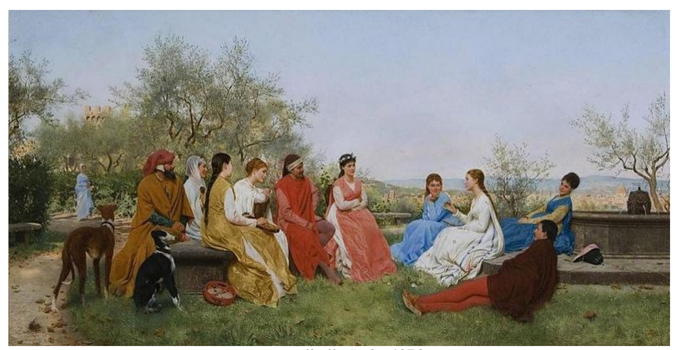
Decamerone, Raffaello Sorbi, 1876

The Decameron by Giovanni Boccaccio, was written in the mid-1300s. It contains 100 different short stories, set within a framing story. In the framing story, a group of 10 well-born Florentines agree to leave the plague-ridden city, and spend a couple of weeks together in the countryside. To pass the time, they picnic, sing, and dance, and each one has to tell a story every day (they take a break on weekends).