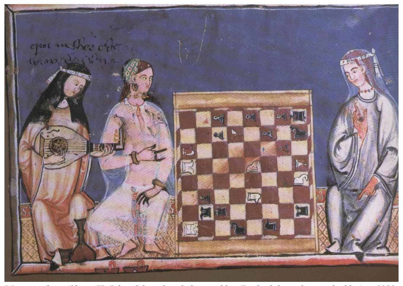
Miniature from Alfonso X's Libro del axedrez dados et tablas (Book of chess, dices and tables), c. 1283.