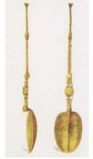
12th Century Anointing Spoon