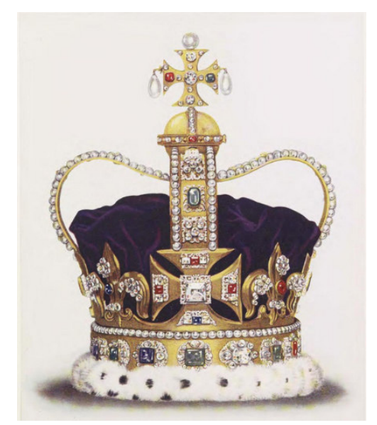
St. Edward's Crown