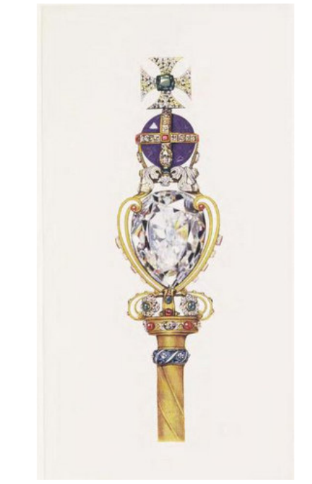
The King's Royal Sceptre