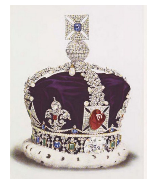
Imperial State Crown