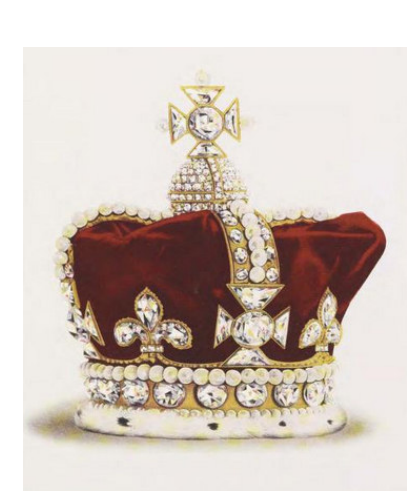
Queen Mary's Crown