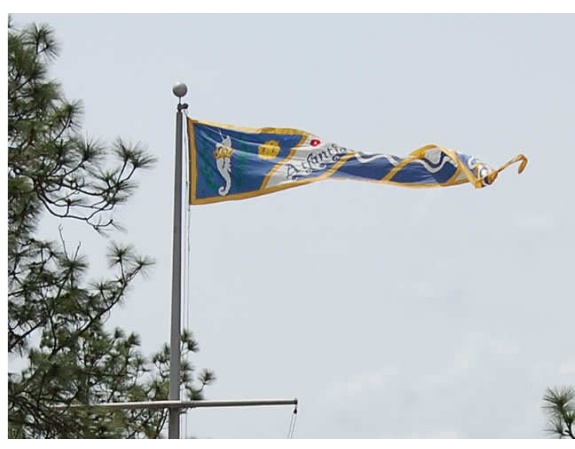
The Atlantian Banner is flown at Crown Tourney