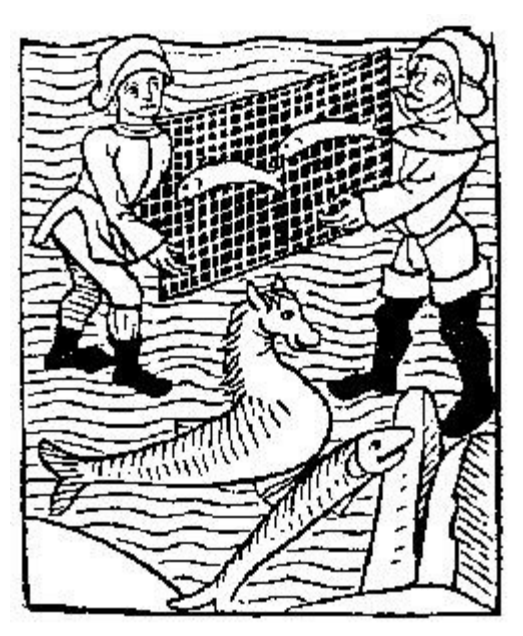
Fishermen and a seahorse; from Medieval Life Illustrations

Also, since there was no meeting in August because of Pennsic, the August and September issues are being combined.