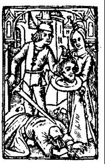
Salome with the head of John the Baptist; detail of a page from Horae , Paris (Pigouchet for Vostre) 1496/97

If you would like to receive Clyffe Notes in printed form, please email me at chronicler [AT]duncarraig.net. Please give me your SCA and Mundane name(s) and your address.