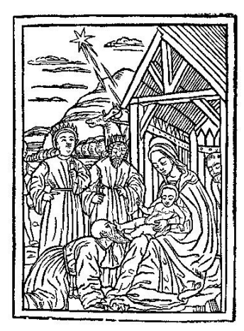
Adoration of the Magi; from Legenda Sanctorum Trium Regum, Modena 1490Adoration of the Magi; from Leg enda Sanctorum Trium Regum, Modena 1490