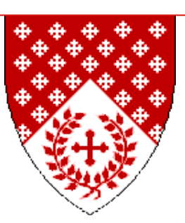
Dun Carraig's Arms

The site that we used for Birthday is a church that will not be occupied at the