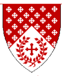
Dun Carraig's Arms

Celtic Society has agreed that SCA can take over the gate. Anybody who volunteers for 3 hours is in for free. Otherwise, tickets are $20 for anybody over 13 years of age. Our booth will be next to the information booth.