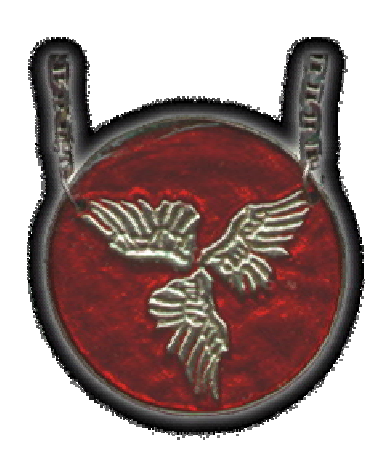
Order of the Seahawk

Company of Dun Carraig's Champions — A company for those who have served as baronial champions. With a medallion of red and white, Heater and Sword (armoured), Buckler and Sword (rapier), drawn Bow (archery), Lantern (A&S)