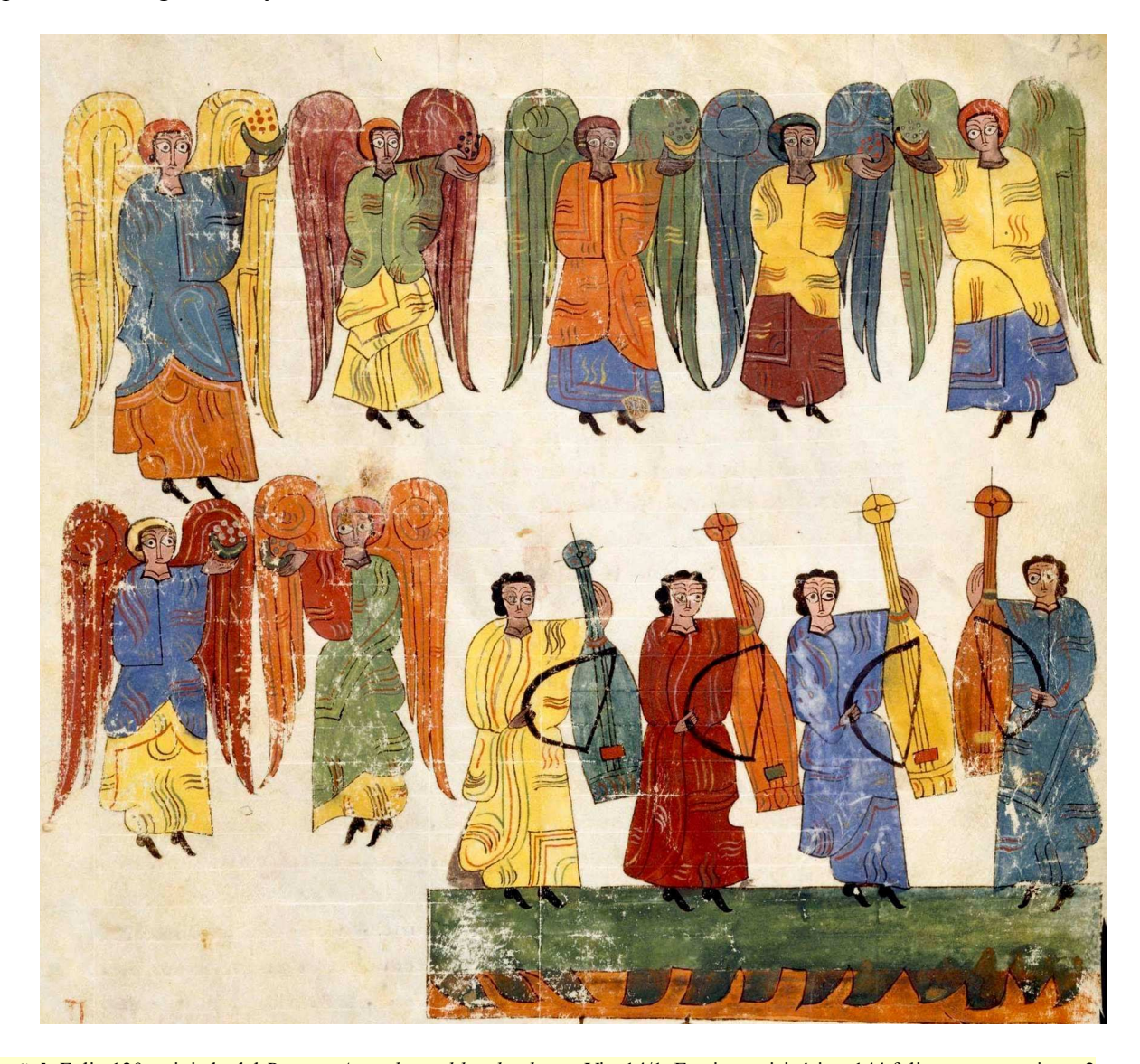
Español: Folio 130r miniado del Beati in Apocalipsin libri duodecim. Vitr-14/1. Escritura visigótica. 144 folios en pergamino a 2 columnas, de 33 a 35 líneas por página. Miniatura mozárabe. Procedente de la biblioteca de Serafín Estébanez Calderón y de San Millán de la Cogolla.

http://archive.org/details/yuletidestoriesc00thor