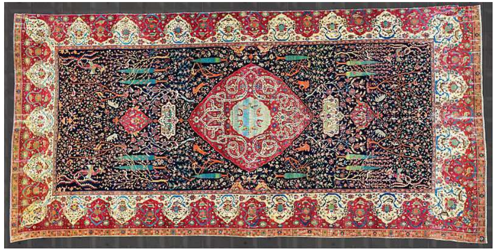
The Schwarzenberg Carpet, 16th Century (Iran). The Museum of Islamic Art, Qatar

https://ia701205.us.archive.org/7/items/OneThousandAndOneNights/an01to10.zip